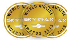
Best Airline in Africa for 3 years in a Row