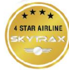
4 star Airline