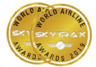
Best Business and Economy Class in Africa for 2 years in a Row