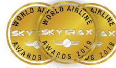
Best Airline in Africa for 3 years in a Row