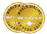
Best Business and Economy Class in Africa for 2 years in a Row